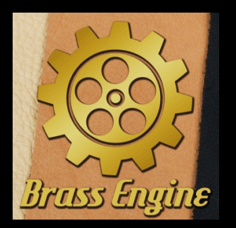
Brass Engine Games