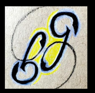
Seth Groves Art